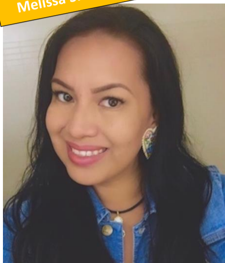
MSc, Health Science, U of L